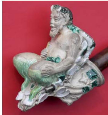
19th Century French pipe depicting Pan

Clay pipes have been used in this country from the late sixteenth century onwards and were made and exported all around the World in huge numbers. They had a short life expectancy and, once broken, were of no further use and discarded. Pipe fragments survive well in the ground and they can be accurately dated from their form and decoration. Furthermore, many pipes are marked, which allows them to be traced back to their individual manufacturers. Most pipes were produced locally in small, family run workshops using regional styles and different shapes and qualities were produced for different markets. These factors make pipes one of the most common and useful artefacts to be found on archaeological sites. Pipe fragments not only produce accurate dating material but also valuable information about trade and social status. Many pipes were also ornately decorated making them interesting objects to collect in their own right. These characteristics make pipes a fascinating field of study, with a wealth of avenues to explore.