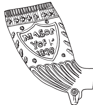
19th century bowl marked MASON from York.